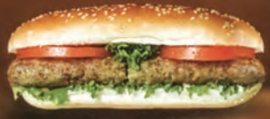
Kabab Supreme Sandwich