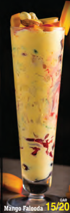
Mango Falooda QAR 15/20