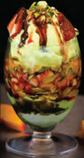
Dry Fruit Salad QAR 18/24