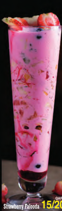
Strawberry Falooda QAR 15/20