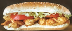
Chicken Lemon Sandwich