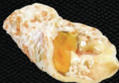
Honey Cheese Paratha