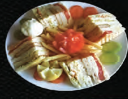
Chicken Sp. Club