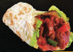
Meat Nashif Paratha