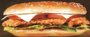
Hot & Spicy Sandwich