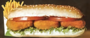
Chicken Nuggets Sandwich