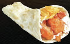
Chicken Spicy Paratha