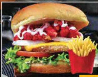
Cheetos Burger Chicken/Beef