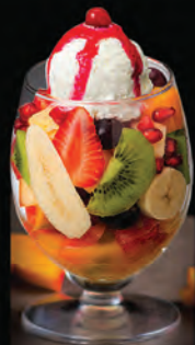
Fruit Salad QAR 15/20