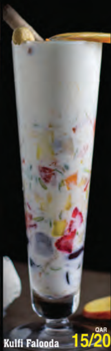
Kulfi Falooda QAR 15/20