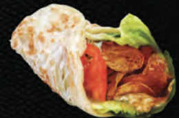
Oman Chips Paratha