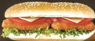
Fish Fillet Sandwich