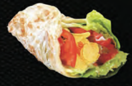
Egg with Oman Chips