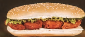
Sheesh Tawook Sandwich