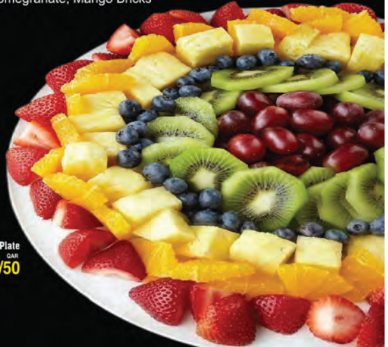
Fruit Plate QAR 20/30/50