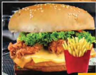
Italian Zinger Burger

A Burger sandwich consisting of a bun a cooked beef patty, and often other ingredients such as cheese, onion slice, lettuce, or condiments. Often used in combination.