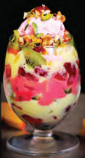
Royal Fruit Salad QAR 15