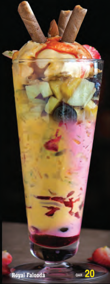
Royal Falooda QAR 20