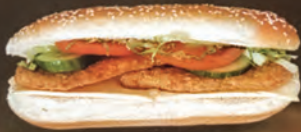
Chicken Fillet Sandwich