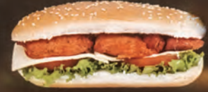
Chicken Tikka Sandwich